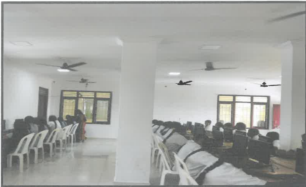
COMMUNICATION SKILL COUNSELLOR