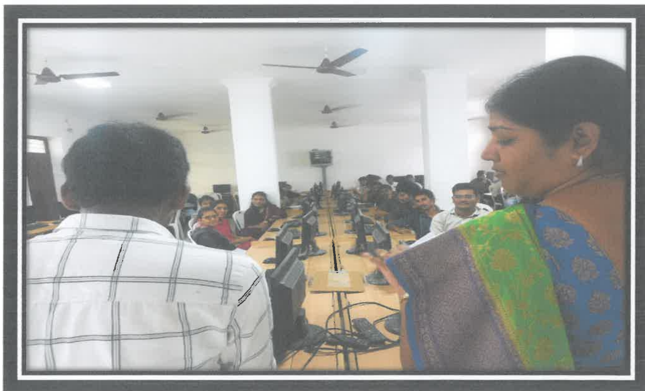
SRI DEVI COMMUNICATION SKILL TRAINER